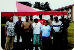
Mt. Zion Housing Board