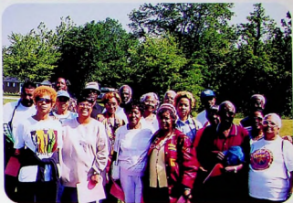
Leadership Planning Retreat