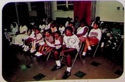
Vacation Bible School

...a workman that needeth not to be ashamed, rightly dividing the word of truth." 2 Timothy 2:15