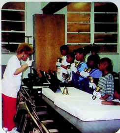
Children's Handbell Choir