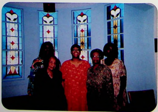
Business and Professionals