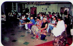
Closing Program for Vacation Bible School

...a workman that needeth not to be ashamed, rightly dividing the word of truth." 2 Timothy 2:15