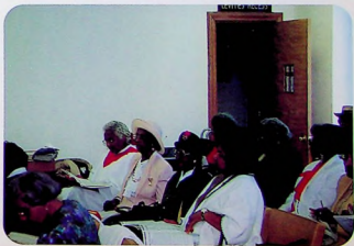
Bible Searchers Sunday School Class