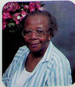
ESTERS, La Verne