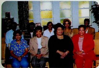
R.T. Andrews Scholarship Commission