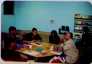
Teens Sunday School Class