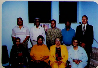
Mt. Zion Federal Credit Union Board

Bus Ministry Crisis Ministry Culinary Committee Mt. Zion Day Care Ministry, Inc. Optimist Club