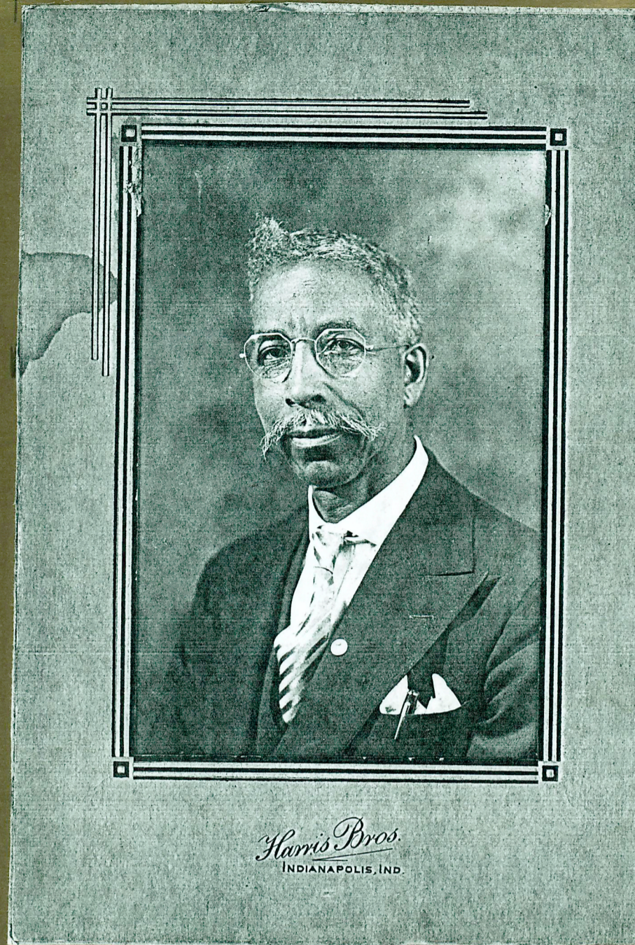
Harris Bros. INDIANAPOLIS, IND.