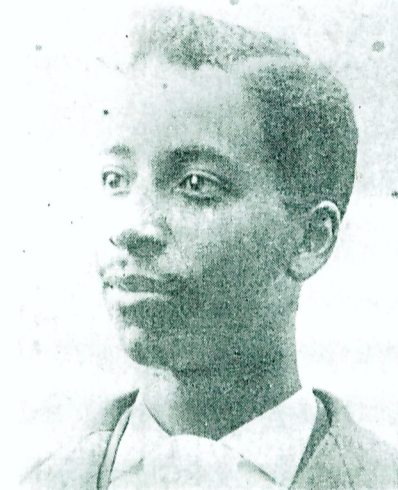
May 1892 (Ministerial Birth)