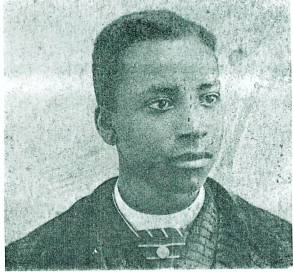
March 16, 1888 (Born in Christ)