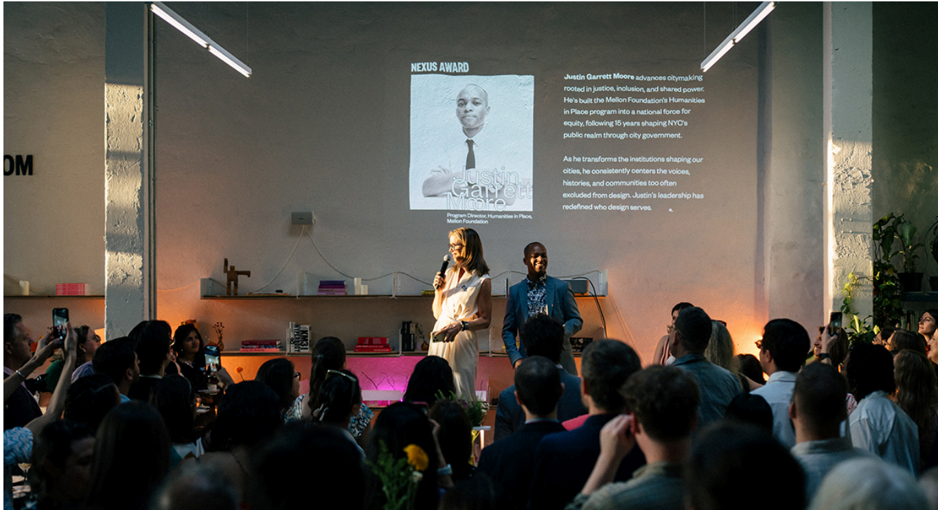
Bond Street Bash 2026.