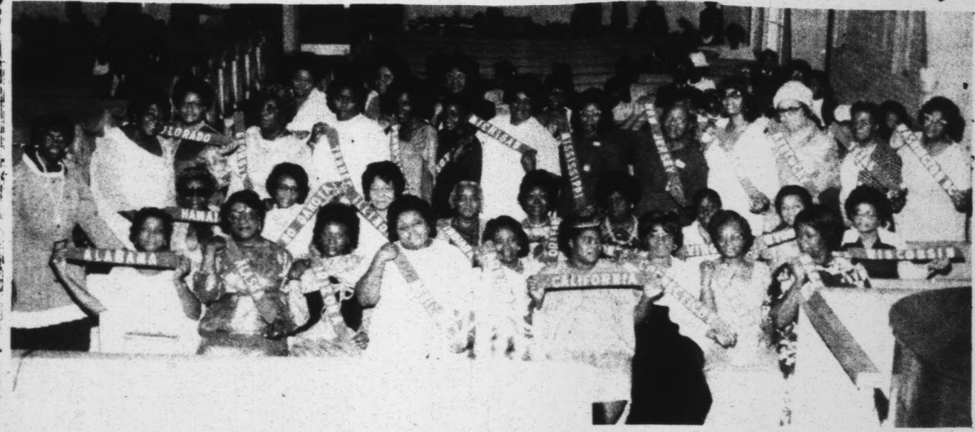
STATE REPRESENTATIVES OF STATE RALLY