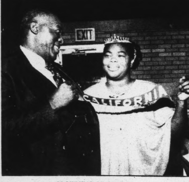
CROWNING OF QUEEN

A State Rally was the Pre-Womens Day project for the Women of Shiloh Baptist Church, 3801 Forest Manor on