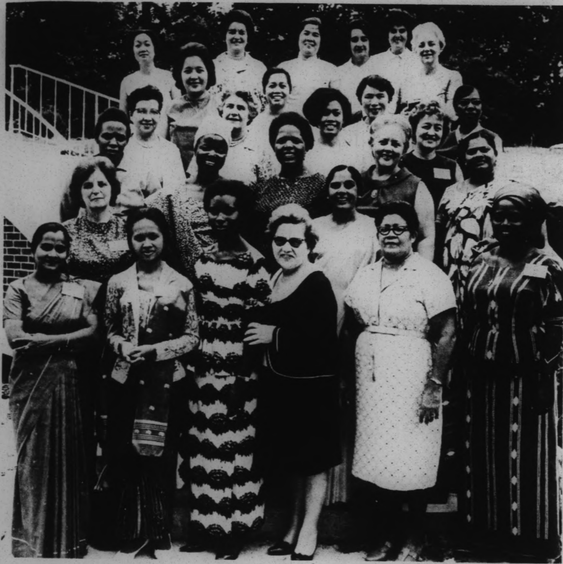
PICTURED ABOVE are a few of the 2,000 women from throughout the United States and 50 foreign countries who travelled to Purdue University last week for the Ecumenical As-